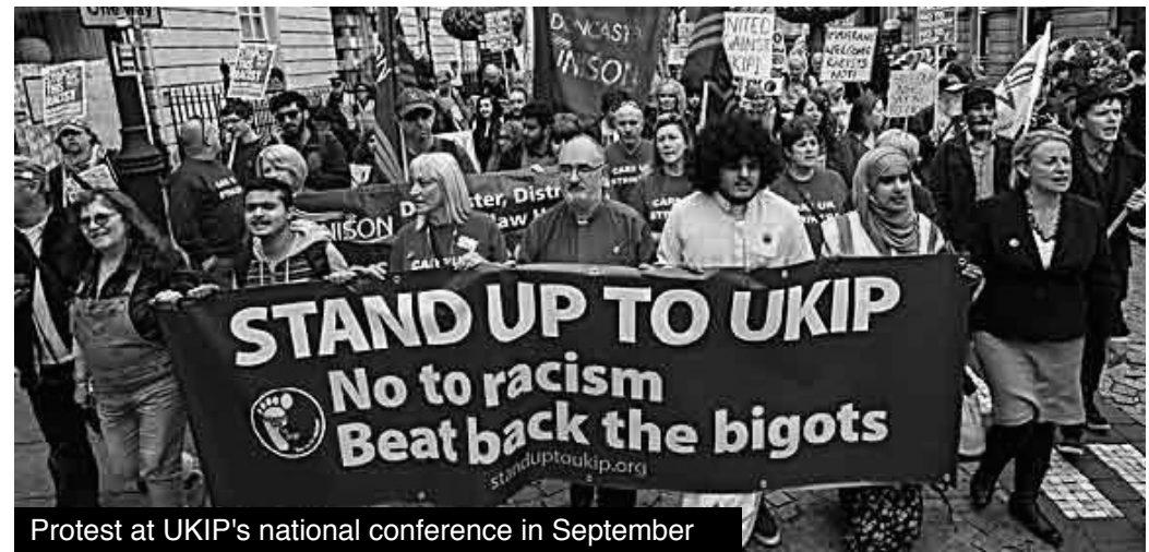
Protest at UKIP's national conference in September

DONT BE FOOLED BY UKIP'S LIES - COME AND DEMONSTRATE AGAINST UKIP'S WELSH CONFERENCE UKIP NOT WELCOME HERE.